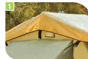
1 Raised climate cover sheet, controls temperatures and reduces condensation.