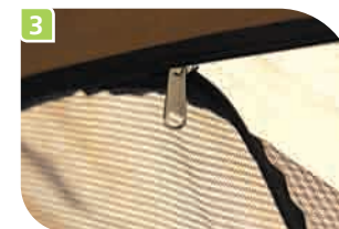
3 Nylon mosquito net screens with YKK zips.