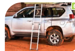
6 Strong, retractable aluminium ladder. (Ladder extension also available for vehicles where the tent sits above 1.9M).