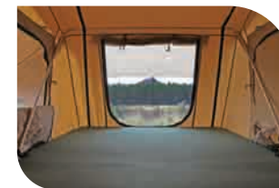
High density, 65mm foam mattress with removable cover.