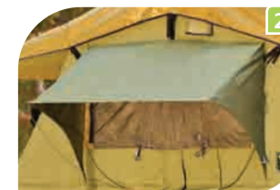
2 Dual pop-up window awnings.