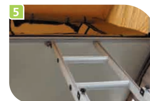
5 Sturdy and lightweight aluminium base.