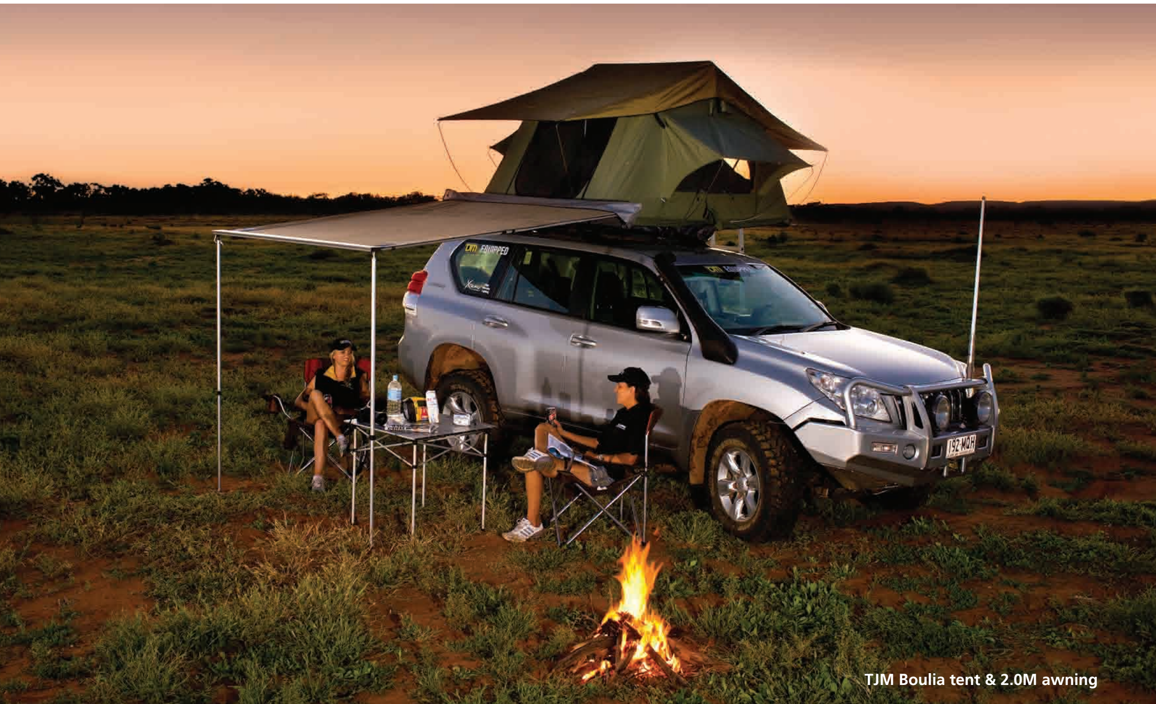
TJM Boulia tent & 2.0M awning