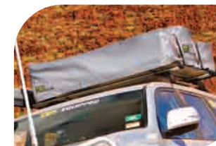
The UV stabilized, water proof and rot proof PVC cover with YKK zippers keeps your tent well protected from the elements whilst not in use.